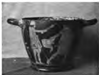
Fig. 95. Odysseus makes himself known to Telemachus.

When Odysseus awoke on the shore of his own island, Athena appeared to him and warned him of the dangers that still awaited him. To secure him further she changed his appearance to that of an old and ragged beggar. It was in this disguise that he presented himself at the hut of the faithful old swineherd Eu mæ'us and asked for